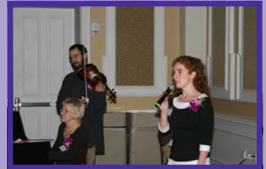
Table Host Prayer Dessert