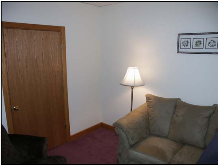
Above and below: two views of the newly furnished room. Clients are able to relax and feel comfortable during their visit to the center.